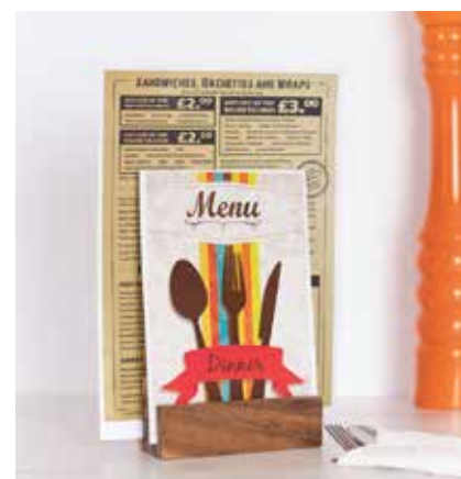
■ MENU, DISPLAY & SIGNS From table markers to menu holders, perfect for setting the table.