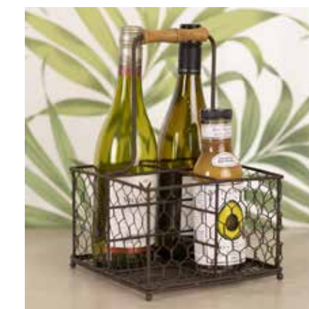
■ TABLE CADDIES Table caddies and storage for when you need that extra pair of hands.