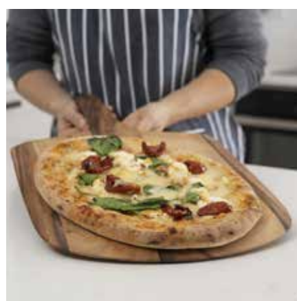
■ PIZZA A selection of perfect boards for pizza, preparing, presenting and sharing.