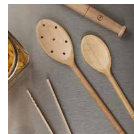
■ UTENSILS The understated essential for back of house preparation. You can never have enough spoons!