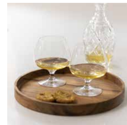
■ TRAYS Made to serve, whether it be room service or table service. These stylish trays will deliver.