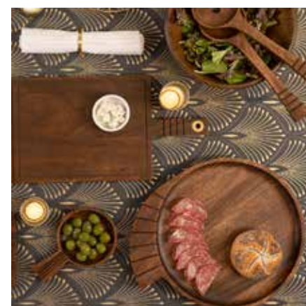
■ GLAMOROUS DINING Add some glamour to your customers dining experience with gold and dark acacia wood.