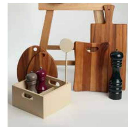
■ BESPOKE Contact us for your bespoke design needs, from mills, boards, cork to utensils.