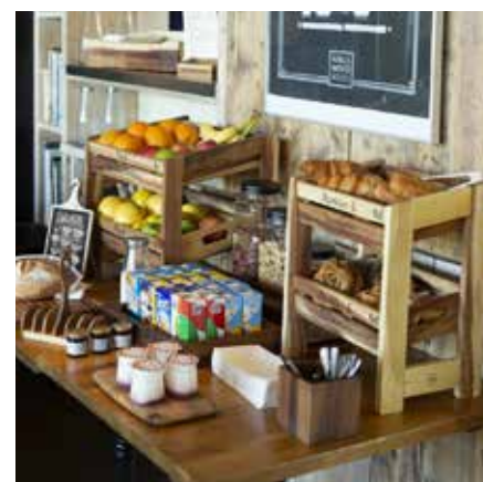
■ BREAKFAST BUFFET Set your customers up right for the day, with beautiful breakfast buffet displays.