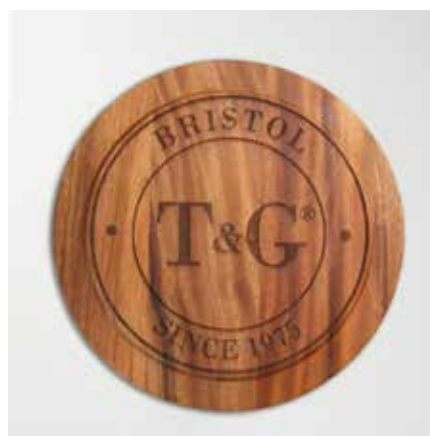
■ LASER ENGRAVING With our in-house laser machine we can engrave your design, add your branding or text to our products.