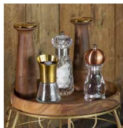
■ SALT & PEPPER MILLS T&G's mill catalogue contains everything you need for salt, pepper, spice mills and shakers.