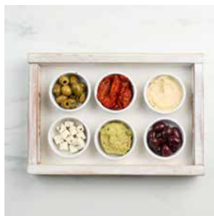
■ BUFFET & COUNTER DISPLAY Be creative and create your own individual look for your displays.