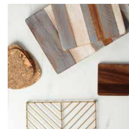
■ STANDS, MATS & COASTERS An assortment of items to help you protect, present and serve.