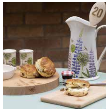
■ SUSTAINABLE Getting back to nature. Ideal accompaniments for your indoor or outdoor setting.

FOR SALT & PEPPER MILLS SEE OUR MILL CATALOGUE