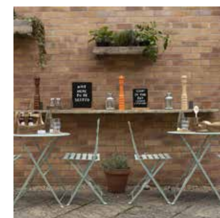
■ AL FRESCO DINING T&G's range of catering products shouldn't be kept hidden away indoors.