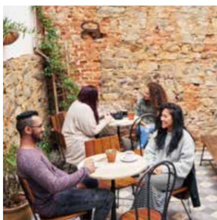
■ CAFE CULTURE Entice your customers in to sit down and relax with their favourite blend.